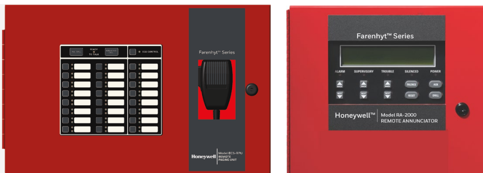
ECS-RPU SHOWN WITH AN RA-2000

For a complete listing of all compliance approvals and certifications, please visit www.farenhyt.com .